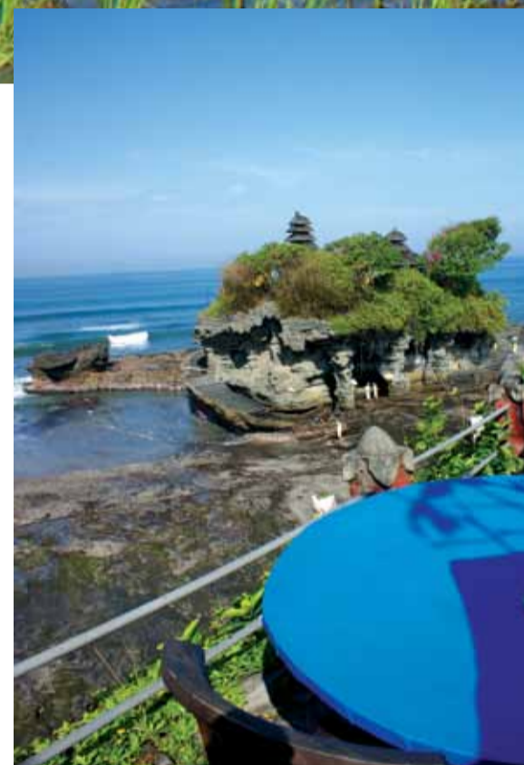
The name Tanah Lot implies: "Land amidst the Sea"

Nirwana Spa will be completed featuring full service wellness activities, including hot, warm and cold dipping pools, rejuvenating steam saunas, several unique relaxation areas, indigenous treatments and organic spa cuisine. We are creating a sanctuary featuring natural and holistic treatments involving blessed ocean, earth and pure air for longer, healthier, more enjoyable life. Pan Pacific Bali Nirwana Resort takes pride in celebrating the blending of Balinese nature, tradition and spirituality with our unique sensual retreat, relaxation meditation, health, wellness and spiritual